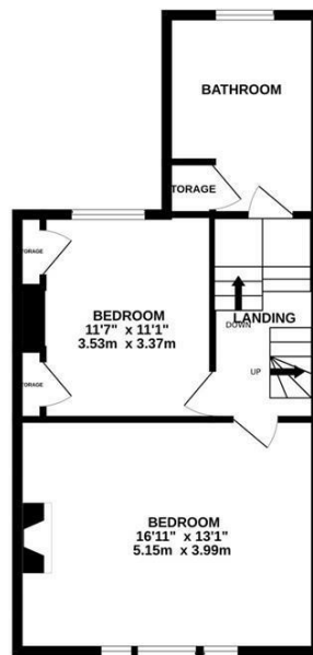
1ST FLOOR 502 sq.ft. (46.6 sq.m.) approx.