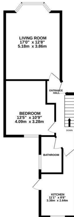
GROUND FLOOR 542 sq.ft. (50.3 sq.m.) approx.