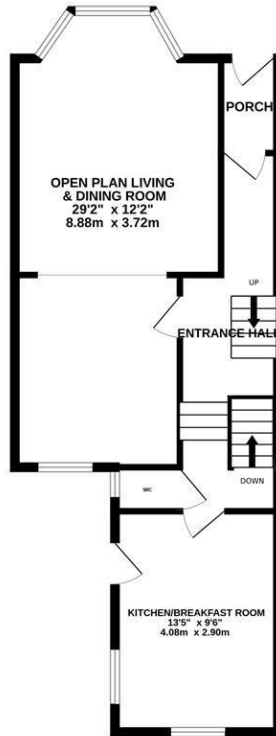
GROUND FLOOR 575 sq.ft. (53.4 sq.m.) approx.