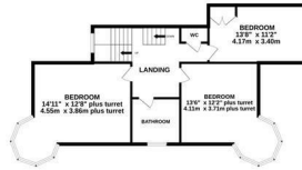
1ST FLOOR 875 sq.m. (22,000 sq.ft.) approx.