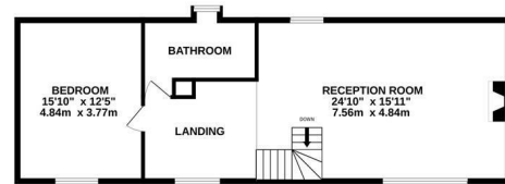
1ST FLOOR 764 sq.ft. (71.0 sq.m.) approx.