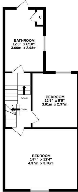
1ST FLOOR 514 sq.ft. (47.7 sq.m.) approx.