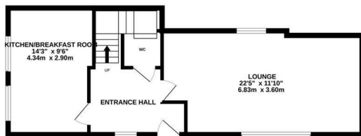
GROUND FLOOR 502 sq.ft. (46.6 sq.m.) approx.