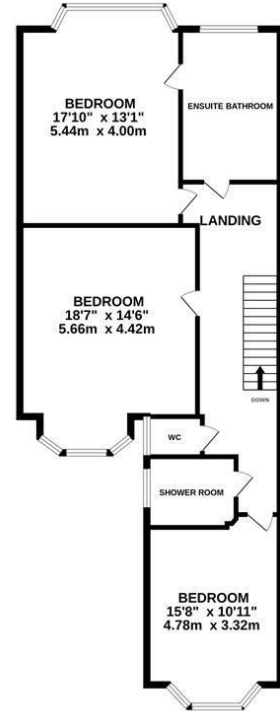
FIRST FLOOR 958 sq.ft. (89.0 sq.m.) approx.