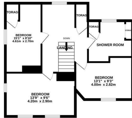
1ST FLOOR 584 sq.ft. (54.2 sq.m.) approx.