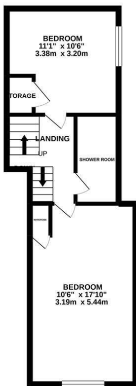
1ST FLOOR 393 sq.ft. (36.5 sq.m.) approx.