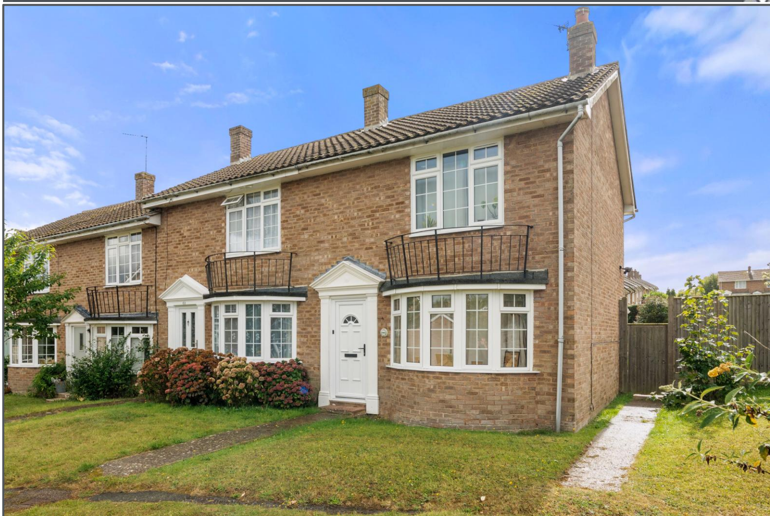
Tower Ride, Uckfield, TN22 1NU