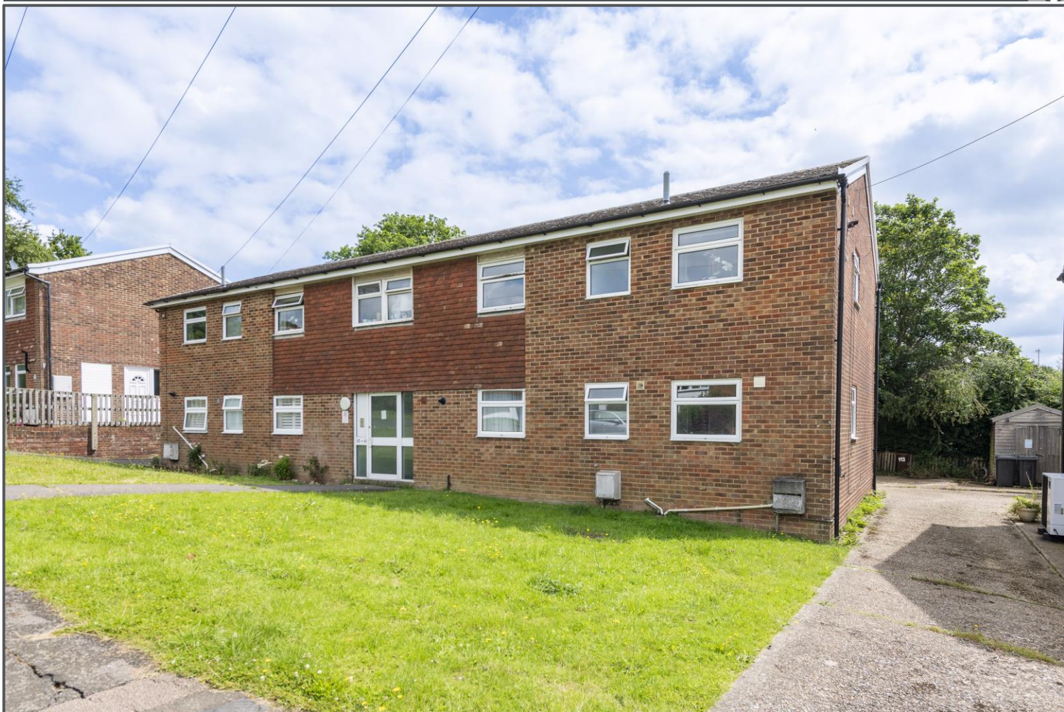
The Drive, Uckfield, TN22 1DB