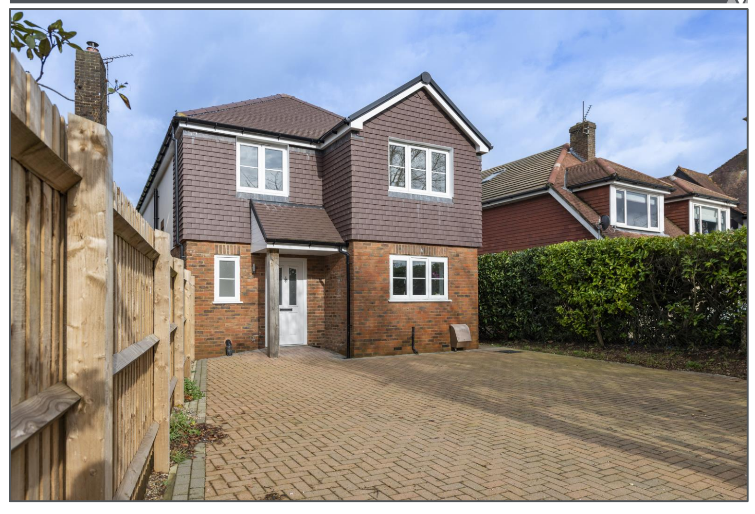
Crowborough Hill, Crowborough, TN6 2DD