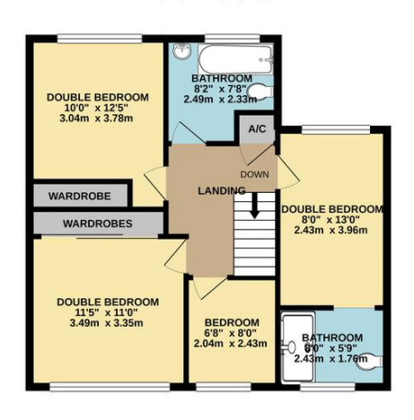
1ST FLOOR 611 sq.ft. (56.7 sq.m.) approx.

TOTAL FLOOR AREA: 1513 sq.ft. (140.5 sq.m.) approx. White every attempt has been made to ensure the accuracy of the floorpian cortained here, measurements of doors, windows, comes and any other tensure are approximate and ror responsibility is fallen for any error, omession or mis-statement. This plan is for fill installed purposes only and should be used as such by any prospective purchase. The prospective purchase is a set of the processible of efficiency can be signed.