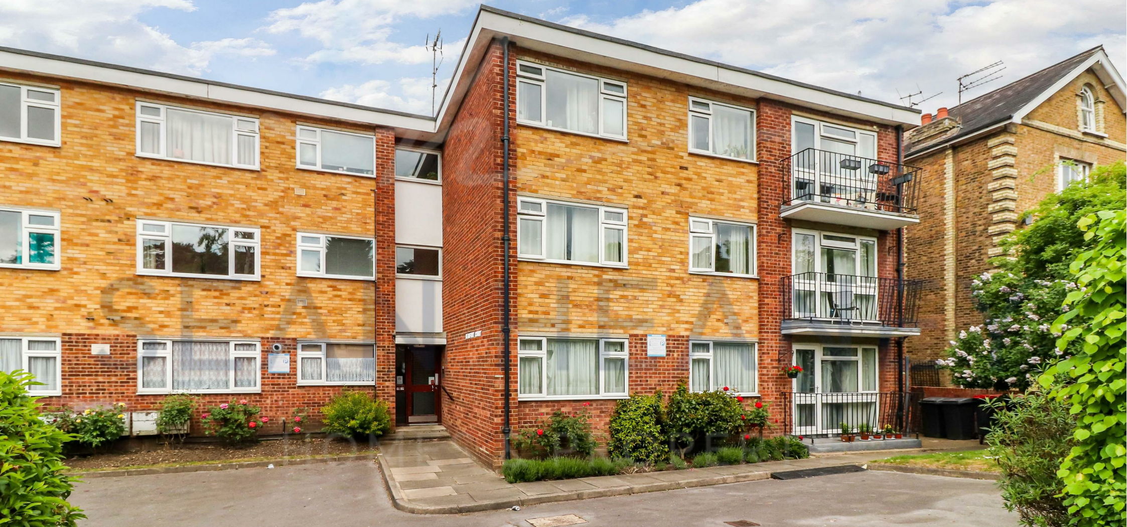
Beaufort Court, Somerset Road New Barnet, EN5 1RW Guide Price £350,000