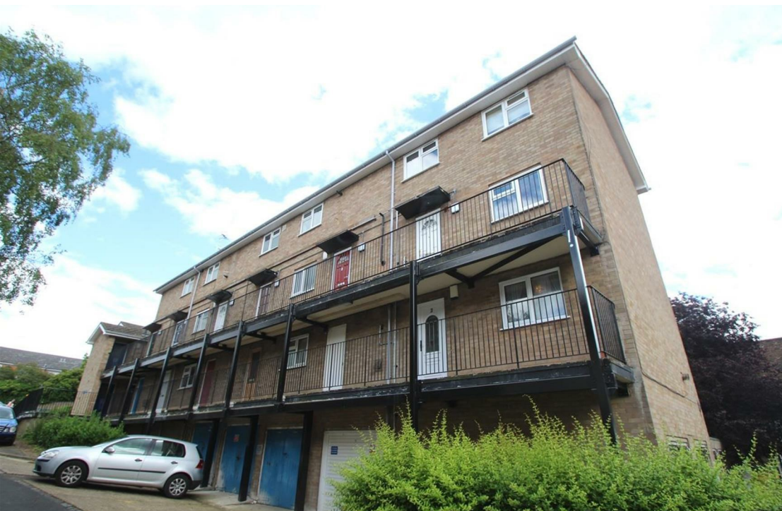
67 Marlowes, Hemel Hempstead, Hertfordshire, HP1 1LE 01442 233533 | www.squirestates.co.uk