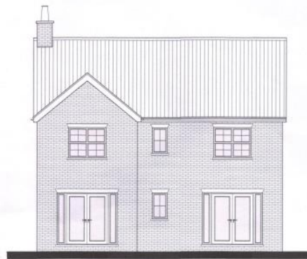
REAR ELEVATION Scale - 1:100