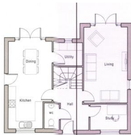
GROUND FLOOR PLAN Scale - 1:100