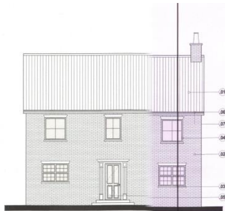
FRONT ELEVATION Scale - 1:100