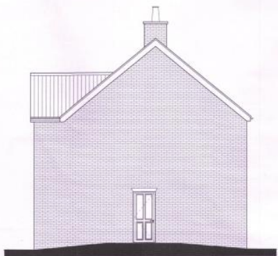
SIDE ELEVATION Scale - 1:100