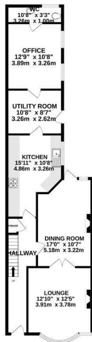
GROUND FLOOR 862 sq.ft. (79.2 sq.m.) approx.