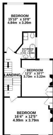
1ST FLOOR 569 sq.ft. (52.7 sq.m.) approx.