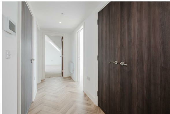
WELCOME TO THE DOWNS QUARTER