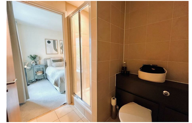
Your Text Here