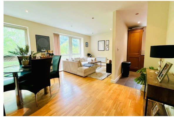
Your Text Here