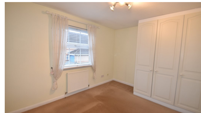
28 Butlers Place