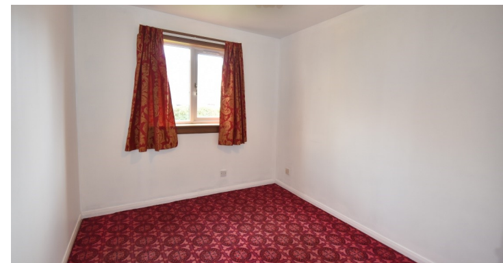
115 Barclay Way