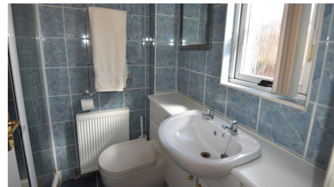
34 Goldpark Place