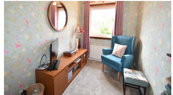
5 Rigg Camps