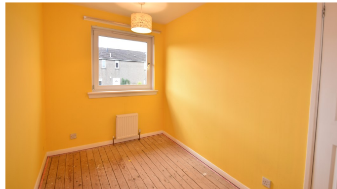
186 Raeburn Rigg