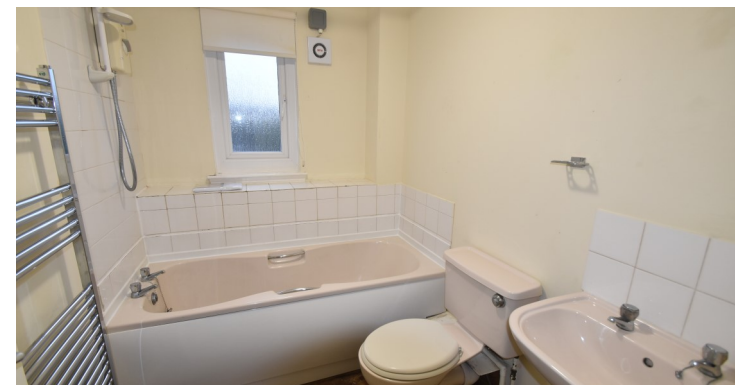
5C Leven Walk