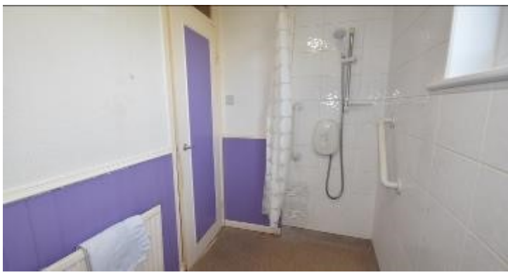
5 Pine Grove