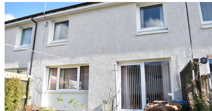
23 Labrador Avenue