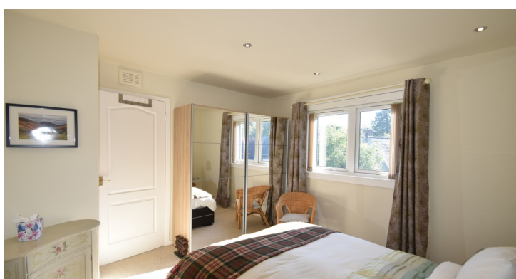
9 The Low Doors