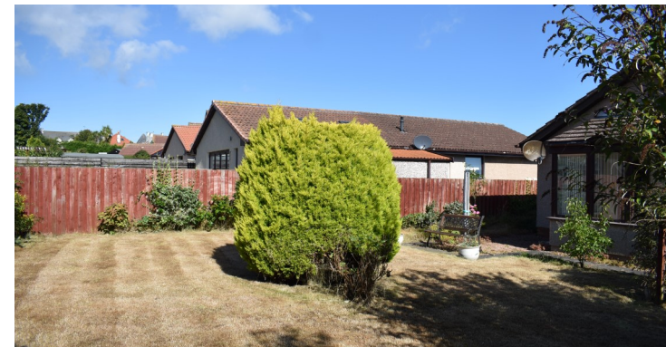
30 Langhouse Green