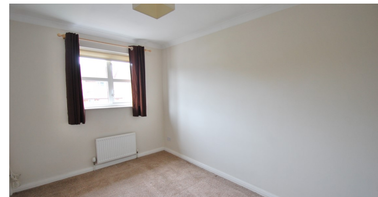
43 Kaims Court