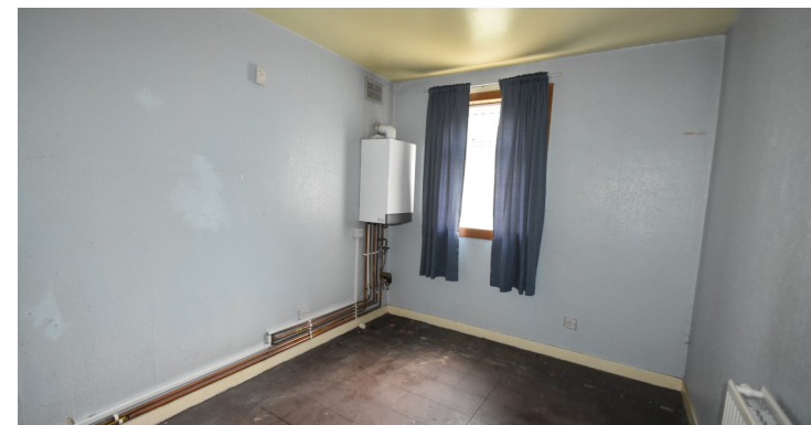
4 Broomhouse Court