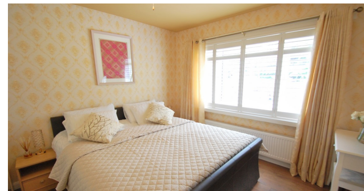
17 Murieston Way