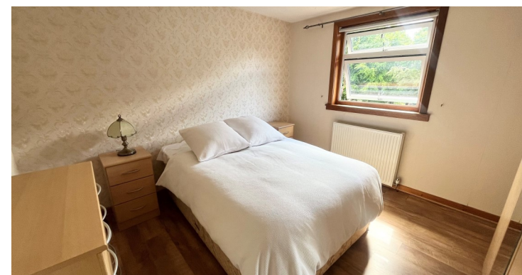
115 Don Drive