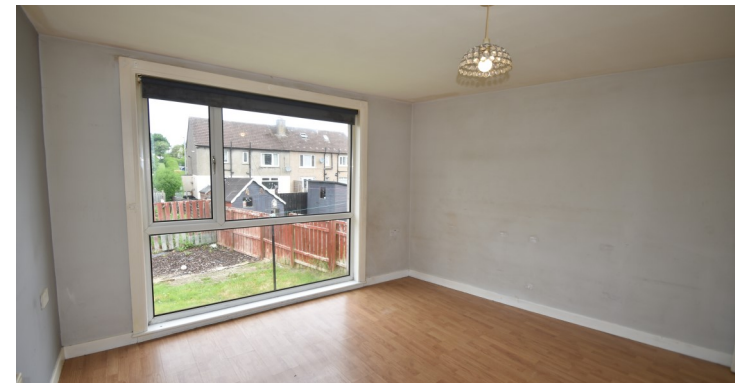
84 Easter Drylaw Drive