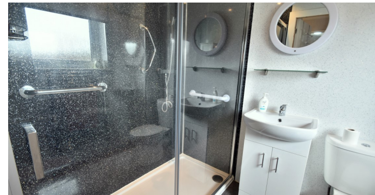
123 Deanswood Park