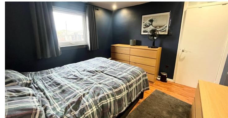
38 Pumpherston Road