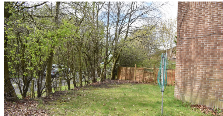
5a Wester Bankton