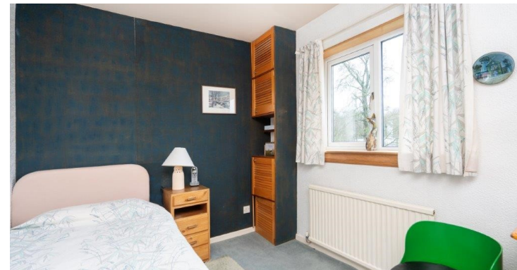
71 Howden Hall Drive