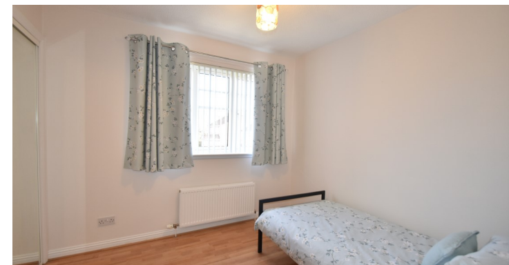
41 Kilne Place