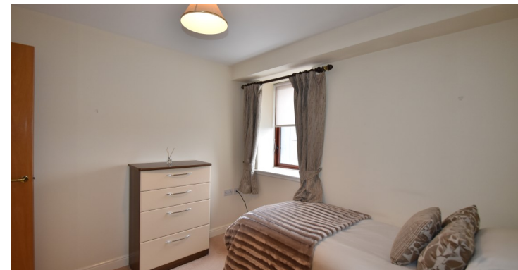
6/51 Roseburn Drive