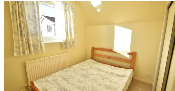
6 Barnes Green