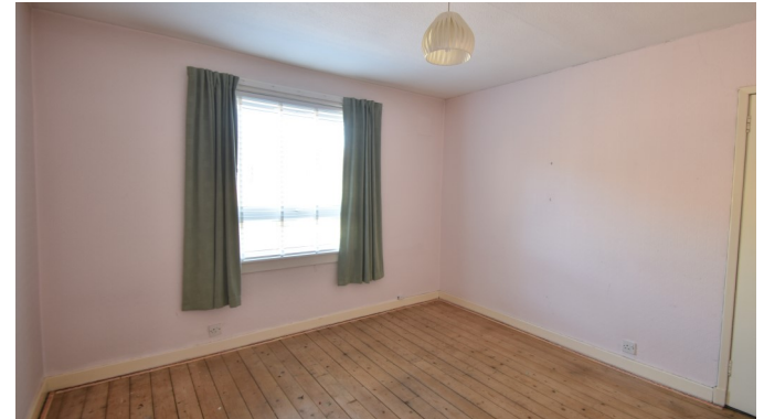
4 Boghall Drive