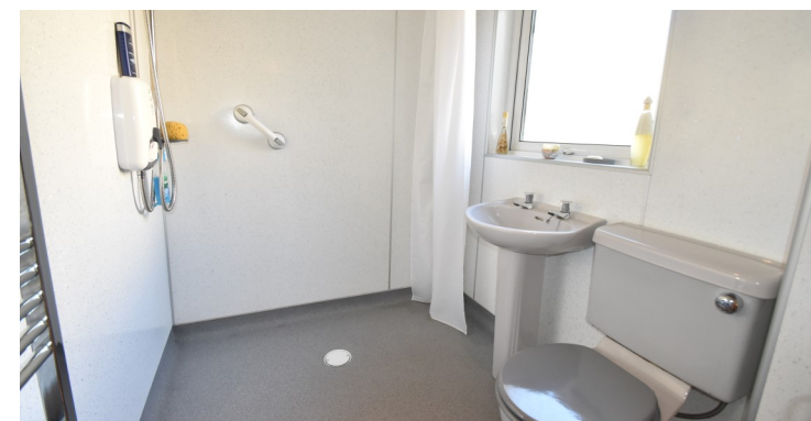
97 Marina Road