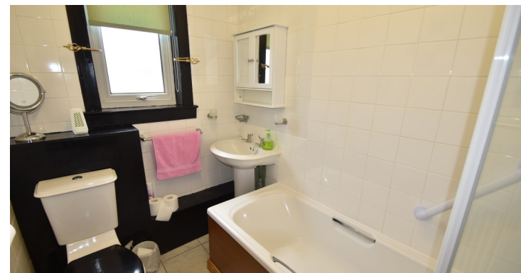
23 Mossie Drive