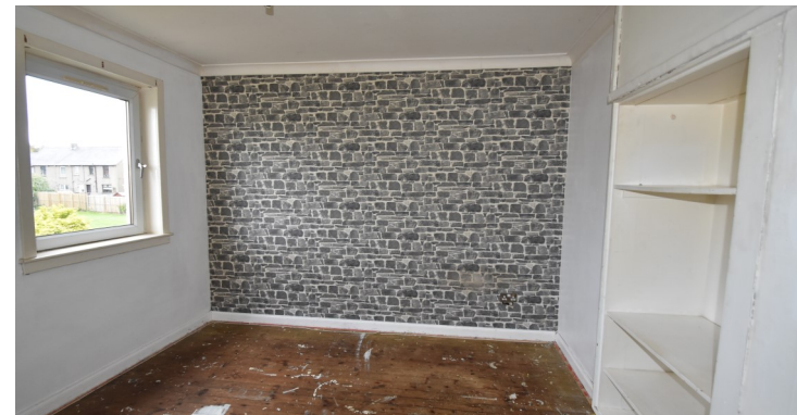
24 Yule Terrace