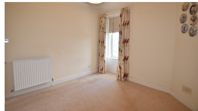
21 Pleasance Square