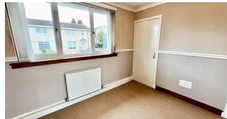
3 Tarduff Drive