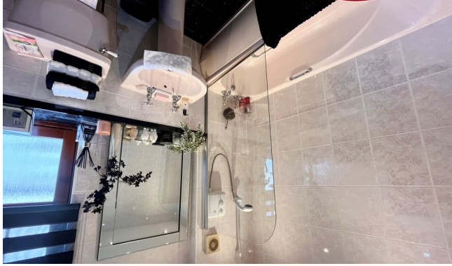
1 Gray Buchanan Court