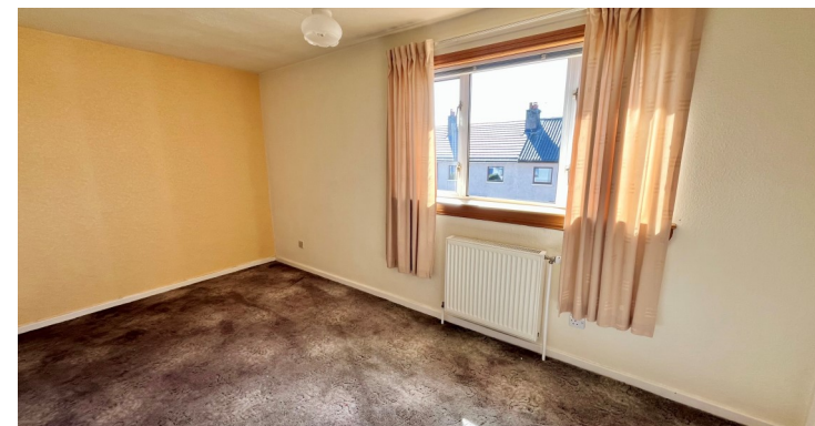
11 Gordon Drive